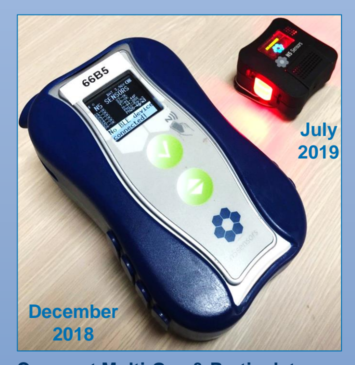
Compact Multi-Gas & Particulate Matter Detector N5 Sensors, Inc. (Rockville, MD) Project Funded by DHS S&T